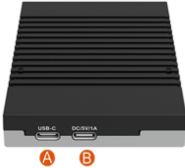
A. USB 3.2 Gen2 Type-C Port B. USB Type-C for DC Input

Then plug it into your iPhone or iPad using the USB-C interface to connect the UBOX-B4BP and open the app to start managing your files. Whether you choose a full backup or selective saving, protect your memories in seconds to backup and enjoy the product.