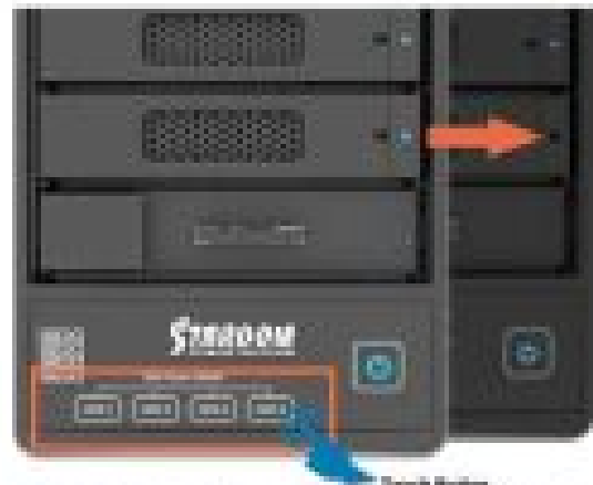
4 hard drive independent power switches

The design with LED indicators and touch buttons makes it easy for users to monitor the status of their drives and control power to the drives with just a touch. This makes it easy for users to manage their storage and access their data. The plug-and-play design means that users can simply connect the HDDs to the system and start using it right away. This makes the ST4F-B32 a solution for users who want to increase their storage capacity without the hassle of complicated installations. Additionally, the system is compact and portable, making it an option for professionals who need to carry their storage solutions on the go.